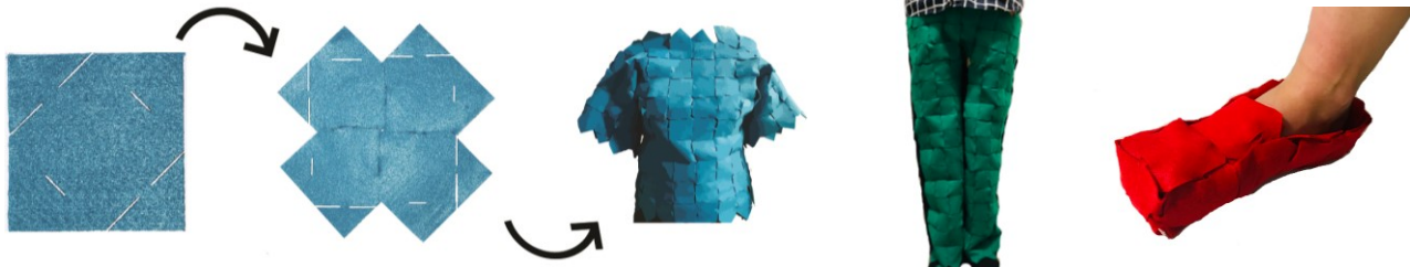
Figure 1 – (a) a single Wearable Bit, (b) several combined Wearable Bits, (c) a shirt, (d) a pair of pants, and (e) a shoe all made with Wearable Bits

Lee Jones Carleton University Ottawa, Ontario, Canada Lee.Jones@Carleton.ca