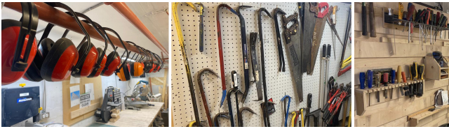
Figure 4: Non-uniform objects in a tool library defy library standards for cataloguing.

Along with returning items during opening hours, all but one of our collections with multiple branches or locations required items to be returned to the same branch (N=7). This was due to objects like instruments being harder to transport than traditional objects like books: “There was no way to safely transport the items between libraries, [so] they couldn’t be part of a regular delivery system” (P23). For libraries with large networks this limits who can access the instrument collection: “We were talking about trying to expand. Right now you can only pick up and drop off your instruments downtown at the big central library, so that doesn’t make it accessible” (P22).