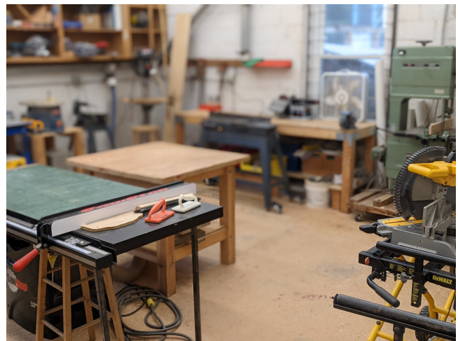
Figure 3: Workshop within a Tool Library.

“It was always very important for us that we not only provide access to the resources, but also to knowledge and skills, so we always had envisioned a space where we can teach workshops. We now have what we call the workspace. Other tool libraries sometimes call it the maker space, or the workshop, so it’s very similar in essence” . (P6)