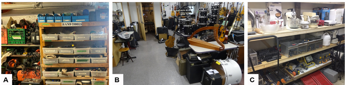
Figure 1: Libraries of Things (LoT) are collections that enable the sharing of tangible objects such as tools (A), musical instruments (B), or cooking equipment (C).

Sara Nabil Queen's University Kingston, Ontario, Canada sara.nabil@queensu.ca